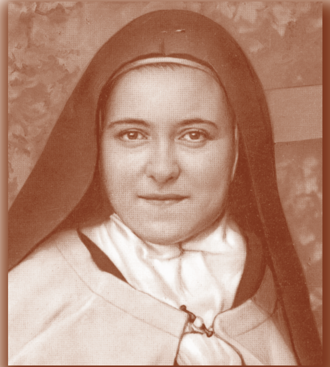
Diocese of Arlington